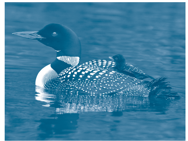
Common Loon – Gavia immer