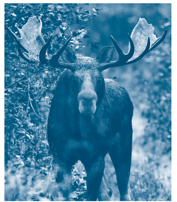
Moose ( Alces alces )

The forests and wetlands are home to birds such as thrushes, woodpeckers, flycatchers, wrens, vireos, warblers, blackbirds, grosbeaks and sparrows. Waterfowl include common mergansers and common loons. Great blue herons, ospreys or "fish hawks," and an occasional bald eagle can be seen in the area. Green River Reservoir and many of the ponds are home to mostly warm water fish species, such as smallmouth bass and yellow perch. Brook trout inhabit the waters and inflowing streams as well as Zack Woods, Perch and Mud Ponds.