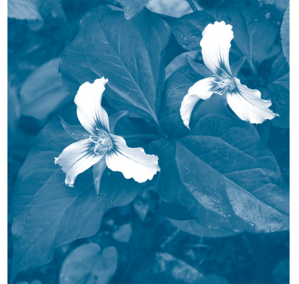
Painted Trillium ( Trillium undulatum )