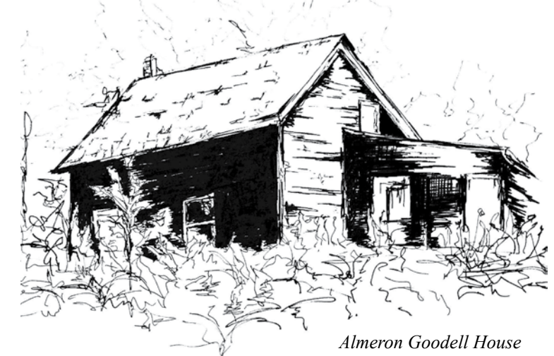
Almeron Goodell House