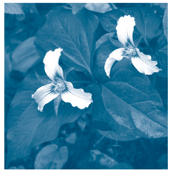
Painted Trillium (Trillium undulatum)