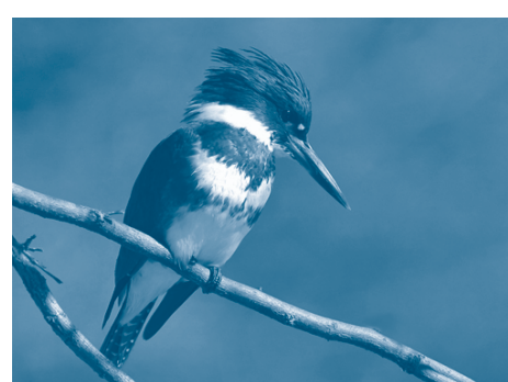
Belted Kingfisher (Ceryle alcyon)

The park will remain in its wild and undeveloped condition, with low-impact, compatible recreational use allowed on and around the Reservoir. Management activities will be only those necessary to maintain the property's character, protect the environment and critical resources, demonstrate sustainable forest management, control excessive recreational use, and ensure high-quality outdoor environment, to enhance the enjoyment for yourself and others please observe the rules and regulations for Green River Reservoir State Park.