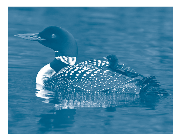
Common Loon – Gavia immer