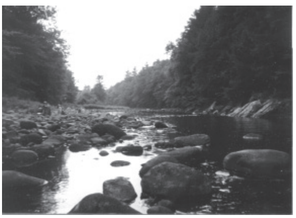
West River, Jamaica State Park

Foot Trails Multi-Use Biking/Hiking Trail Whitewater Paddling Scenic Waterfall & Riverway Open Early May - Indigenous Peoples' Day