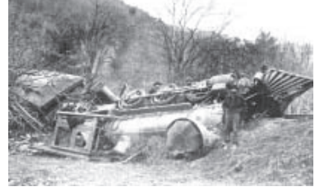
West River Railroad locomotive crash, Newfane

For more information on Jamaica State Park, ask park staff or visit our website. Interpretive programs are offered from mid-June until Labor Day.