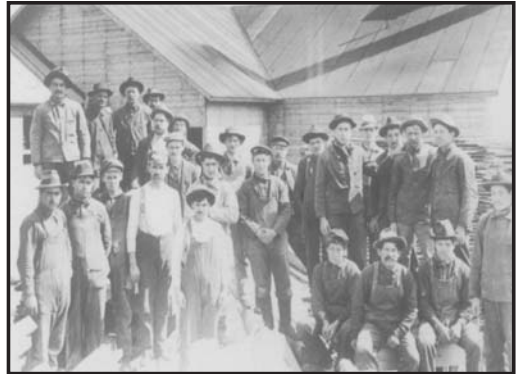
Portugese, French and Yankee workers at Miller's Mill

Originally the Groton Pond Lumber Company sawmill, this mill changed hands several times. It was rebuilt in 1904 after burning when a boiler exploded. The explosion killed one man and is said to have sent a boiler flying across the lake. The mill's sawdust pile is still evident.