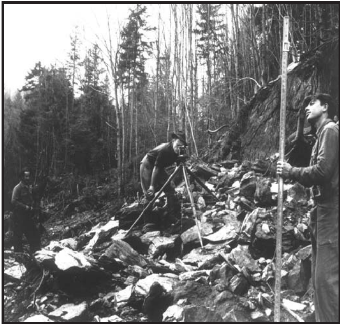
A CCC Crew working on road construction

The following pages describe the sites located on the center map. Look for these as you travel through the forest. Suggested tours of Groton by foot and bike are given at the end of the guide.