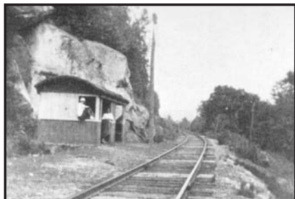
Rocky Point Flag Stop

Midway on the western side of Lake Groton, the flag stop was an old railway coach with one side removed. The seats on the ends and one side were retained. The site is now marked by a large pile of boulders. Although it was only a short distance from the water, the campers, laden with provisions, had a tough time on the steep, rocky slope.