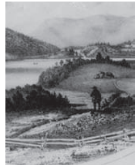
Echo Lake, circa 1860