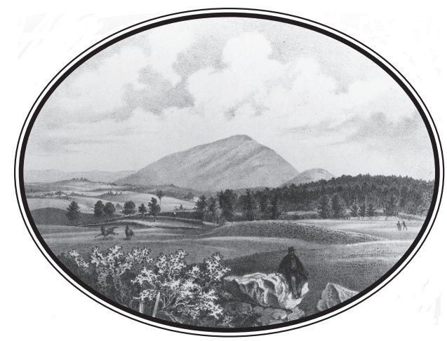
view of Mt Ascutney, from Knapp Pond, circa 1860