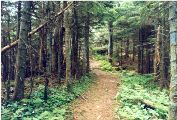
Forest highway outside New Discovery in the Groton Forest

Groton Forest is the second largest state forest in Vermont with over 26,000 acres to explore. Trails for horseback riding in the park include gravel-surfaced roads, forest highways (logging roads), the Vast Trails, and the Montpelier-Wells River Rail Trail. Horseback riders wishing to ride for the day can trailer their horses to the northern parking area near the entrance to New Discovery State Park, the Kettle Pond Day Use parking area, or at the public boat launch at the southern end of Ricker Pond. Riders can easily access the Montpelier-Wells River Rail Trail (Cross Vermont Trail) and forest and town roads from these locations.