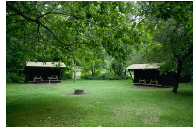
Groups/Horse camping lean-to area in Camp Plymouth

While there isn't a horse trail system in the park itself, there are other areas close to the park offering many trails. Nearby Hawk Mountain Resort ( www.hawkresort.com ) has a trail system covering 1,200 acres at no charge to Camp Plymouth campers. Other places to ride include the Green Mountain Horse Association ( www.gmhainc.org ) in South Woodstock, or any number of dirt or class IV roads that can be found in the Vermont Gazetteer.