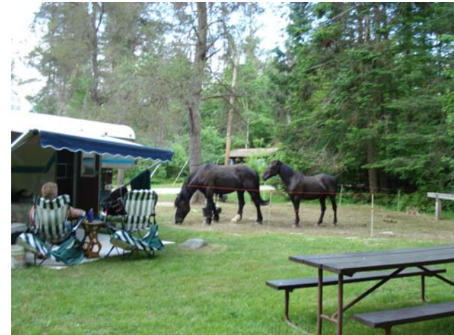
Horse camping at New Discovery State Park